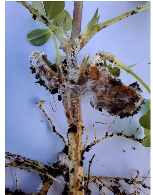
Fig 2. Pathogen mycelial mass colonizing peanut plants at the early growth stage