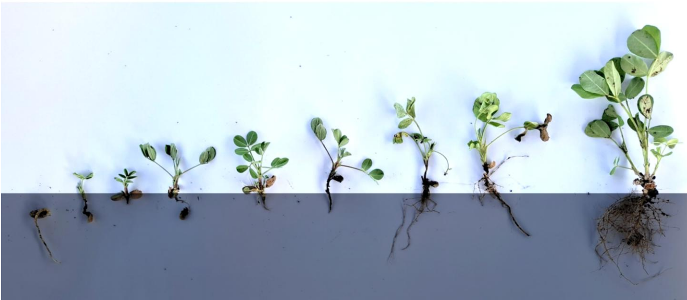
Fig.1 Germination of peanut under pre-emergence and post-emergence damping-off conditions