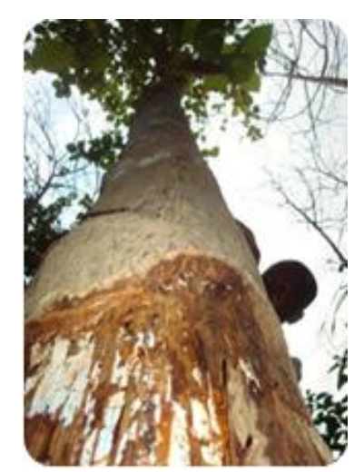
Figure 2b. Rot of stem with mycelia mat at base.