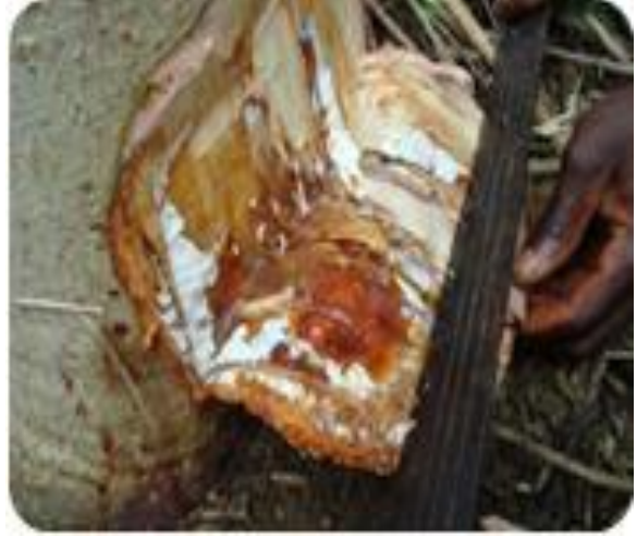
Figure 3a. White mycelia under bark of cedrela stem. Table 2. Disease incidence in Cedrela odorata plantations.