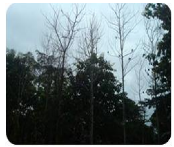
Figure 2a. Death of teak trees.