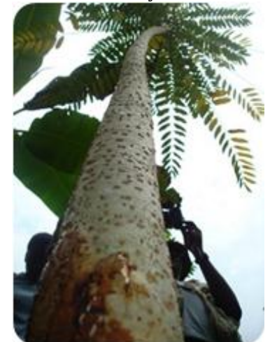
Figure 3b. Disease in Cedrela odorata plantations.