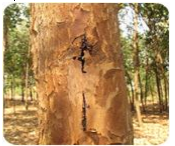
Figure 4. Botryosphaeria canker on trunk of Eucalyptus tree.

Diseases of Eucalyptus species: Low levels of disease (<1.0%) were observed in Eucalyptus plantations; however, Cylindrocladium leaf blight was common on Eucalyptus trees in plantations of APSD Ghana Limited. A Calonectria species was also found causing rot in the nursery.