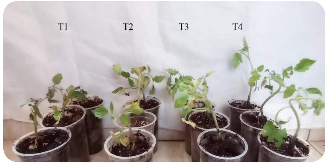
Figure 4. Disease severity % on infected tomato plants with A.solani ALS4 under greenhouse condition. T1*: pathogen ALS, T2*: Control untreated plants, T3*: Mancozeb + ALS, T4*: Bp1+ ALS