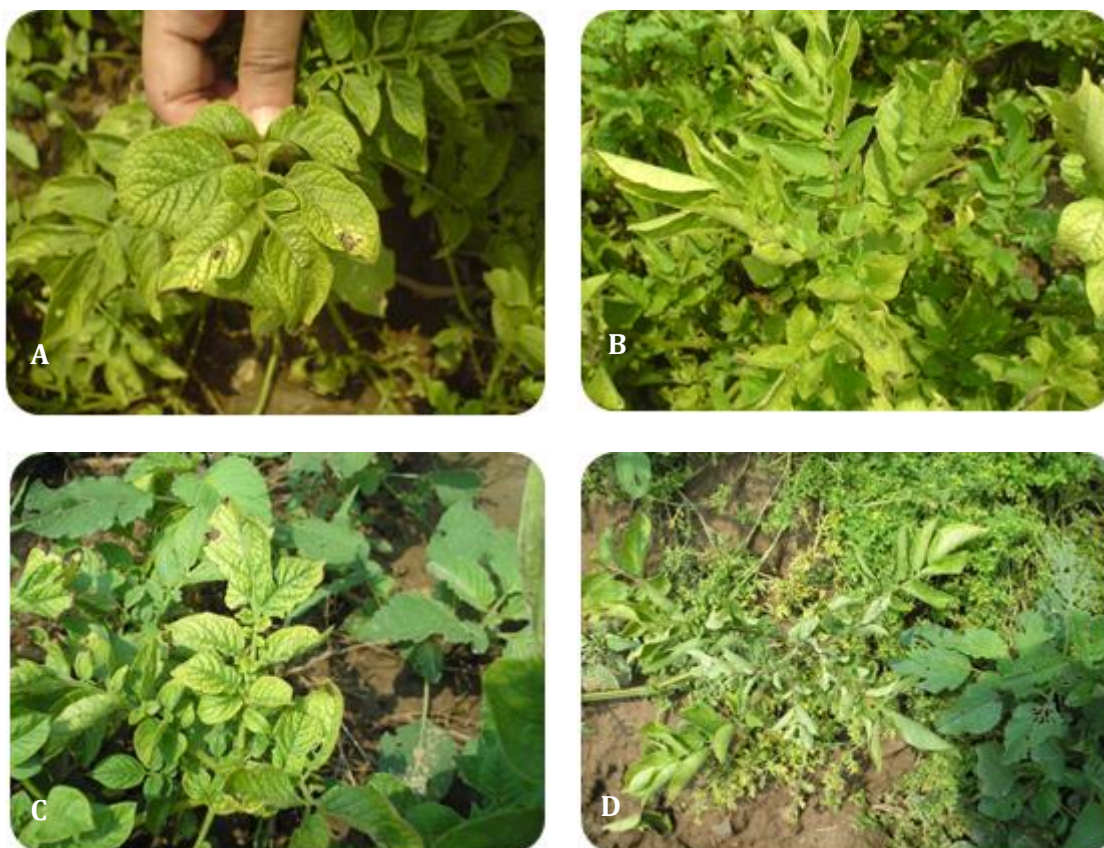
Figure1: Potato plants showing symptoms of mosaic, mottling, yellowing (A,C) and leaf rolling (B,D) at the time of sample collection from different districts.

pattern as a sampling procedure (Zehnder, 2010). A single sample consisted of three single leaves plucked from top, middle and bottom of potato plant and placed in appropriate labeled polythene zipper bags to indicate location, sample number and date of collection. These samples were brought to virology lab at Federal Seed Certification and Registration Department, Islamabad and stored at 4°C until testing.