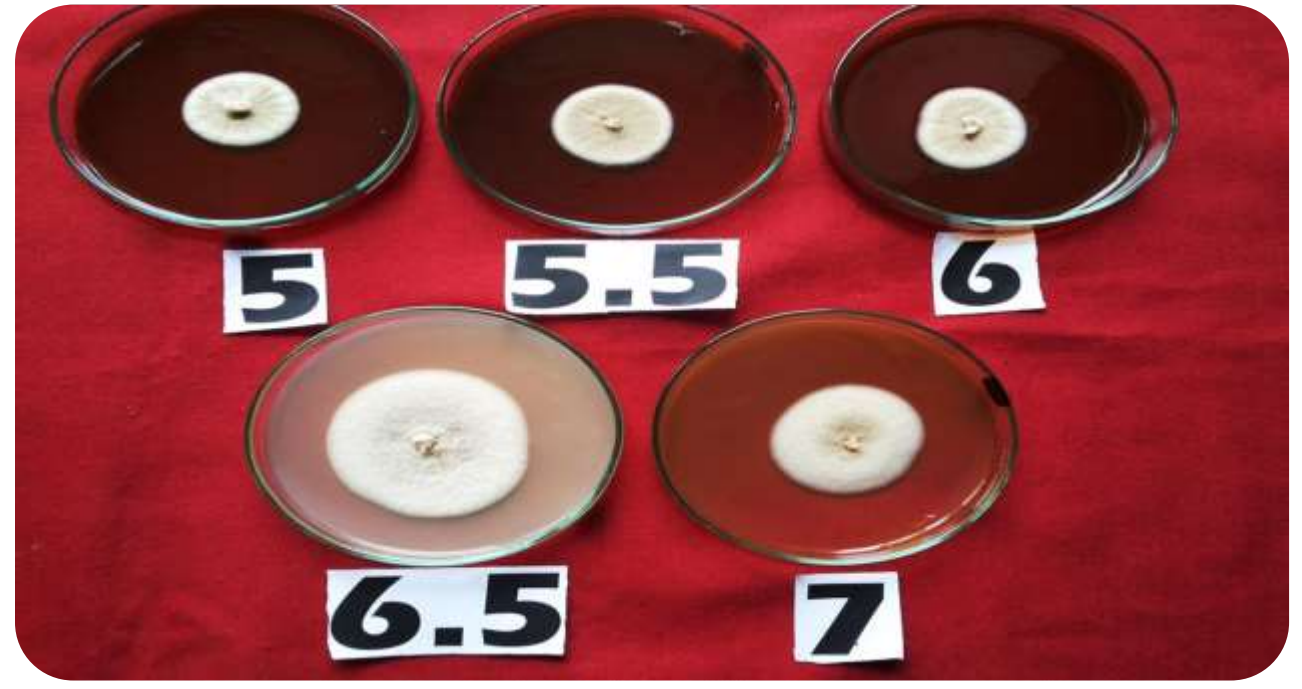
Figure 5. Effect of pH on the radial mycelial growth and sporulation of Gleosporium ampelophagum .

of water at pH of 6.0. Minimum conidial production of 3.39 \times 10^6 conidia per ml of water was recorded at 5.0 pH. These results are in agreement to various researchers delineating that pathogen causing anthracnose of grapes exhibits maximum radial mycelial growth at pH 6.5 (Pandey et al. , 2011; Bhat et al. , 2019; Fayaz et al. , 2021a).