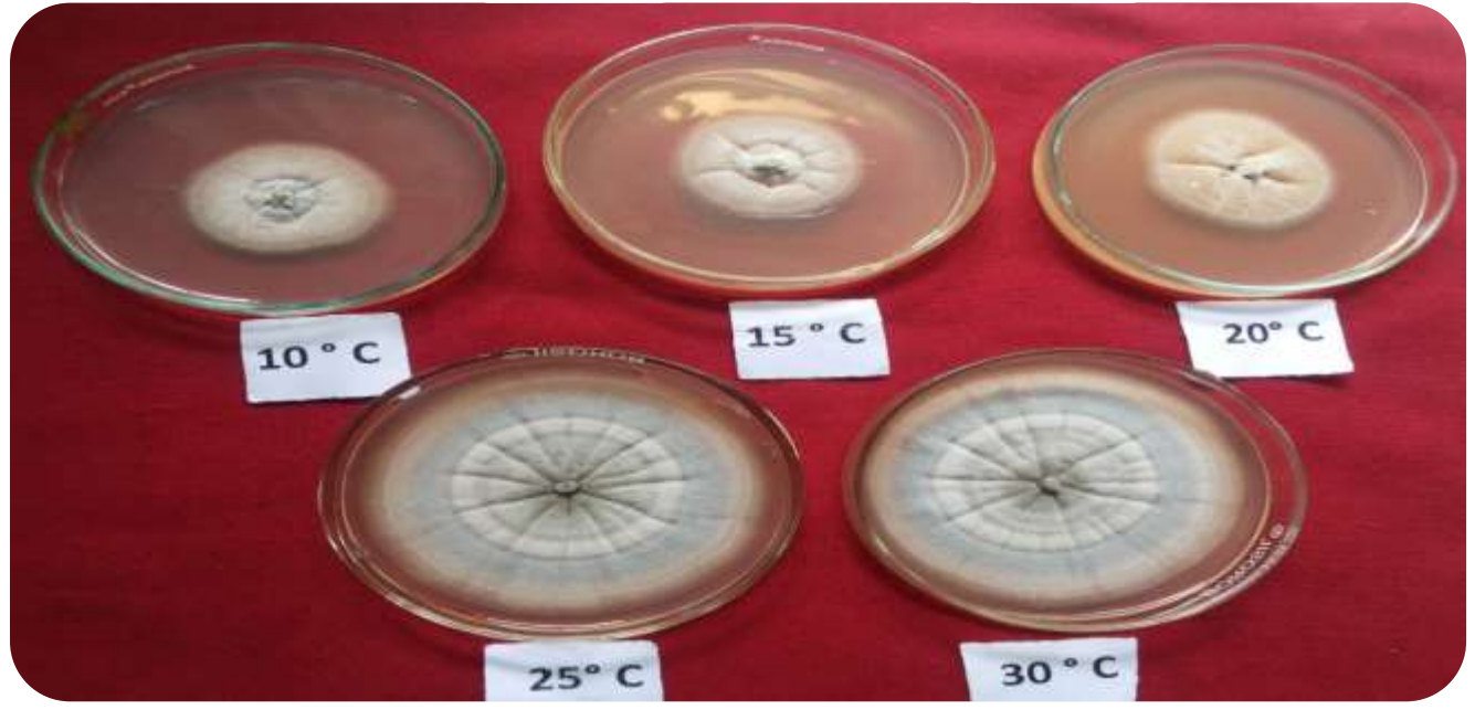
Figure 4. Effect of temperature on growth and sporulation of Gleosporium ampelophagum after 7 days of incubation.

conidial production of 5.95 \times 10^6 conidia per ml of water was recorded at 25 °C which was at par at 20 °C with conidial production of 5.31 \times 10^6 conidia per ml of water at 30 °C. Conidial production of 5.24 \times 10^6 per ml of water was recorded at 30 °C. Minimum conidial production of 2.24 × 10<sup>6</sup> per ml of water was recorded at 10 °C.