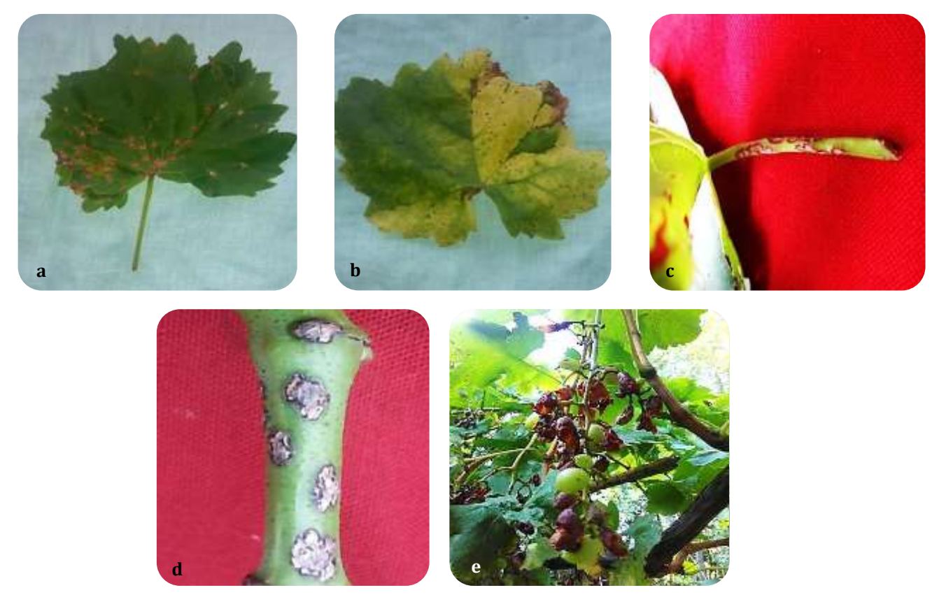
Figure 1 a. Coalescing of lesions on leaves, b. Chlorosis and downward curling of leaf margins, c. Elliptical, brown and sunken lesions, d. Elliptical and sunken lesions with ashy grey centre, e. Shrivelled and rotten berries of grapes.

The fungus inoculated on Petriplates were critically observed for colony characters, growth behaviour on oat meal agar and are presented in Table 4. After 3 days of incubation at 25±2 °C, the colony appeared as circular and cottony with light green centre and creamish margins with groves inside measuring about 15.20-20.34 mm in diameter (Figure 2a) which after 7 days, turned circular and cottony, olive green in colour, surrounded by flat creamy margins measuring about 31.23-34.78mm in diameter (Figure 2b) and after 10 days, changed to floccose greyish white with black centre and development of radial furrows (Figure 2c) attained diameter of 76.10-79.23 mm.