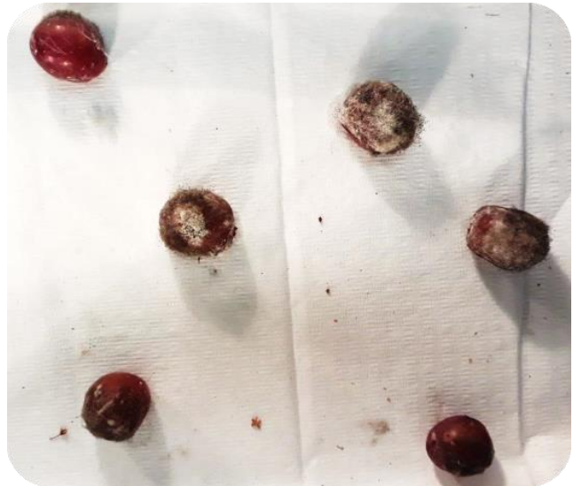
Figure 4. Pathogenicity test showing black to light brown, fluffy mycelium.