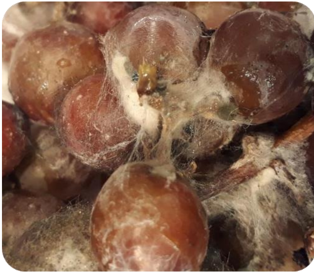
Figure 1. Infected fruit with water-soaked, black to light brown fluffy mycelial growth.