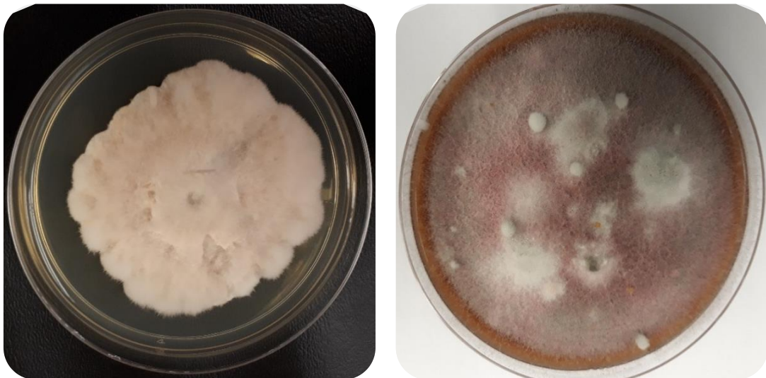
Figure 2. Fungal colony showing white, cottony mycelium that later turned to violet and dark purple on PDA media.