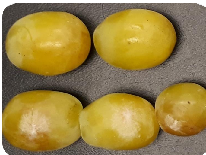
Figure 5. Pathogenicity testing showing white to light pink mycelium on the inoculated fruit berries.