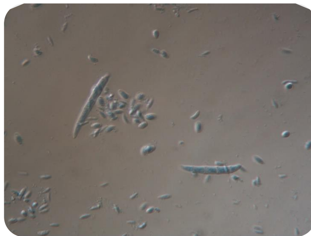
Figure 3. Microscopic characterization of Fusarium proliferatum .