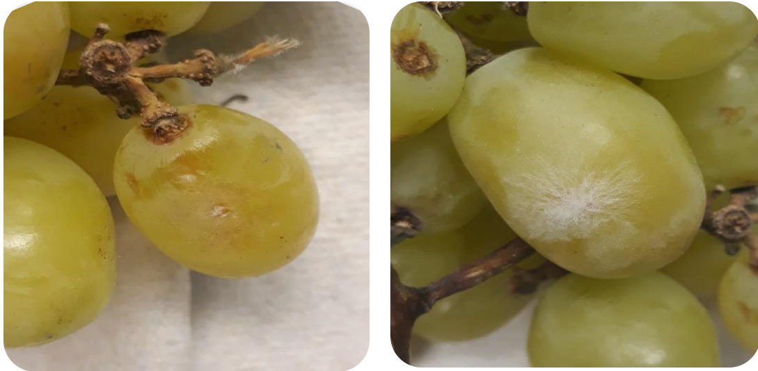
Figure 1. White to light pink mycelium on the infected fruit berries.