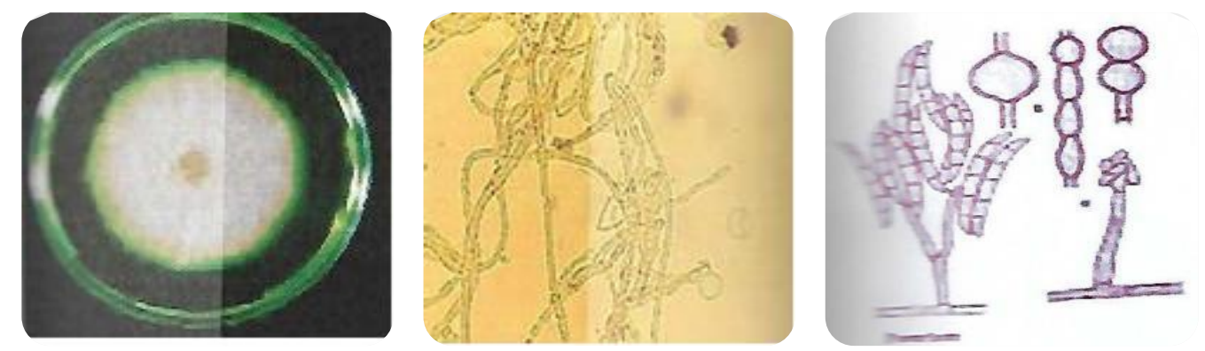
Figure 3. Fusarium poae (A) Growth on Czpek's Dox Medium (B) Microstructures (C) Conidiophore

prevalence of fungal pathogens. The minimum humidity of 21% was recorded during March and April whereas it was the maximum during rainy season. The high humidity resulted in the increase in the prevalence of these fungi by creating favorable conditions for the fungi. It was found that the incidence and prevalence of fungal pathogens greatly increased during rainy season and caused much damage to dates (Markhand et al., 2010).