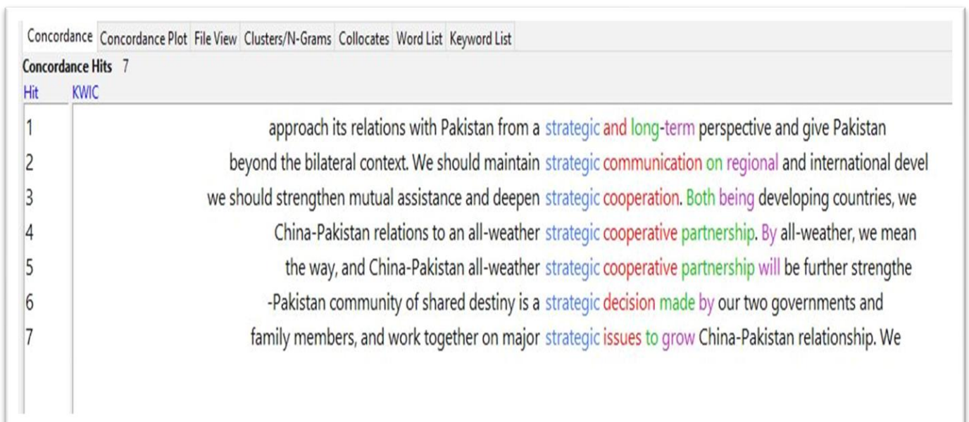
Figure 5. KWIC Concordances for word Strategic in Xi Speech to Pakistani Parliament.

strategic decision, strategic issues, etc. He knew that both countries are located in the most important strategic region, so cooperation between them would usher in a new era of development and progress.