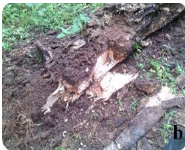
Figure 1. The Ant nests of Myopopone castanea in the palm plantation. a= ant nest in oil palm stump; b= ant nest in fallen palm oil stems.