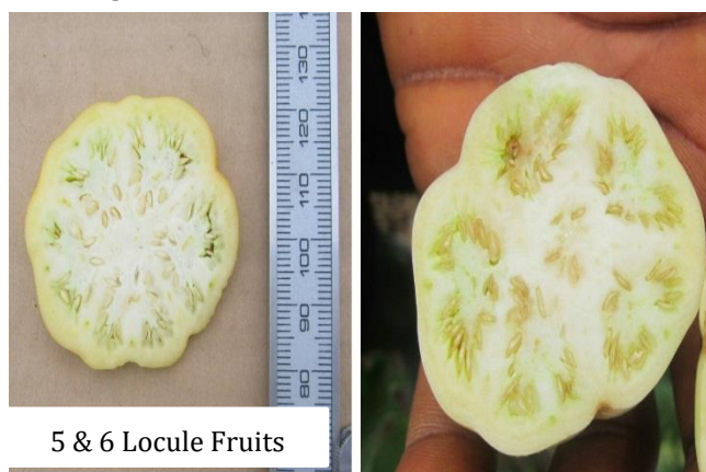
Figure 3. Cross Section of Fruits