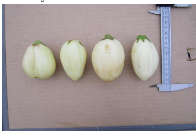
Figure 5 & 6 Widest Part of the Fruit

Assessment of Insect pest infestation: The infestation of stem and shoot borer (Figure 7), was very high in almost all the farms visited. Seventy percent (70%) of the farms visited had various level of the pest infestation. The other major pest observed was Calpodethlius (leaf roller). In an attempt to control the heavy infestations of pests on their farms, respondent farmers