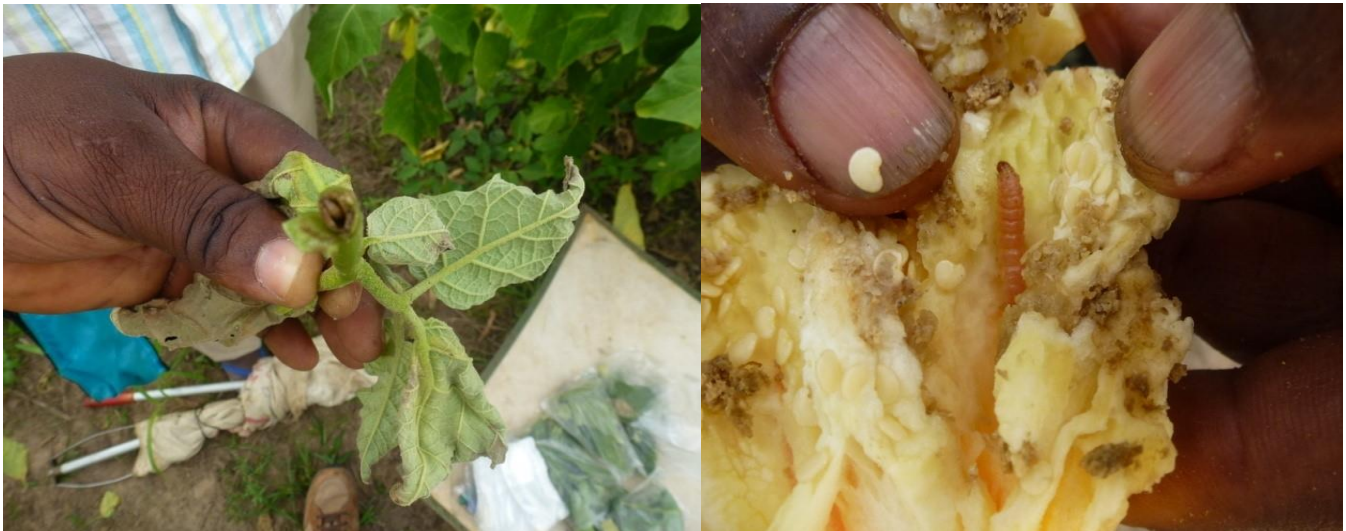
Leucinodes in the Garden Egg shoot and fruit