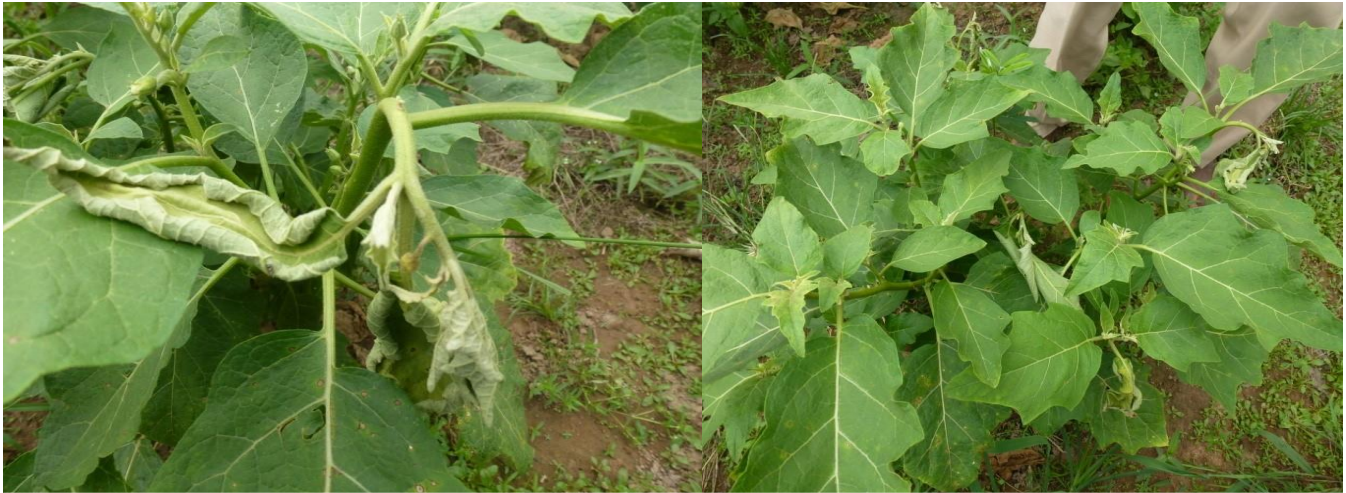
Garden egg plant infested with the Egg plant fruit and shoot borer ( Leucinodes orbonalis )

the need to educate garden eggs farmers on the hazards of indiscriminate use of these broad spectrum chemicals. Farmers were of the opinion that, the presence of pests reduced yield and discouraged production because the pest found its way into the fruit, rendering the fruit unmarketable and causing a yield loss of up to 90 percent (Baral et al. , 2006). According to Sharma (2002) the pest reduces the quality of eggplant and also the vitamin C levels in the fruits up to about 80 percent. This coupled with other factors make eggplant production less lucrative hence farmers leave to grow other commodities (Gapud & Canapi, 1994).