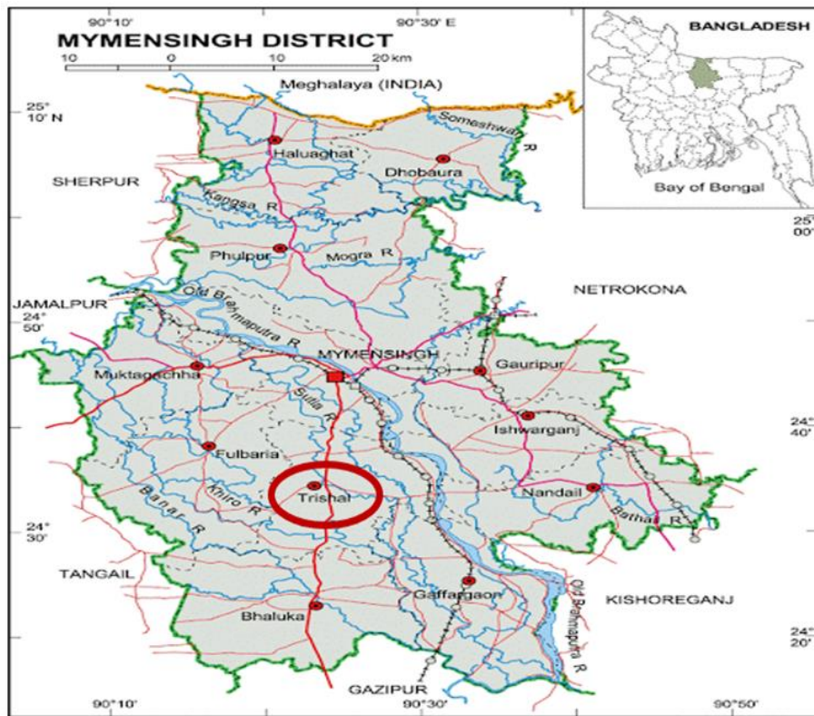
Figure 2. Map of the study area.

Pangas fish farming and associated activities (Hossain et al., 2019). The targeted population of this study was the Pangas fish farmers in Trishal upazila. A multi-stage sampling technique was used to select the sample. Firstly, two villages (Bailor and Kanthal) of Trishal upazila (Figure 2) were selected purposively as a large number of the targeted population were there. Then using the simple random sampling technique, primary data were collected from a total of 60 (based on the targeted population) sample Pangas fish farmers from July to September 2022. The semi-structured interview schedule was used to collect the information as some portions were open-ended for the respondents like what problems they faced and what would be their suggestions.