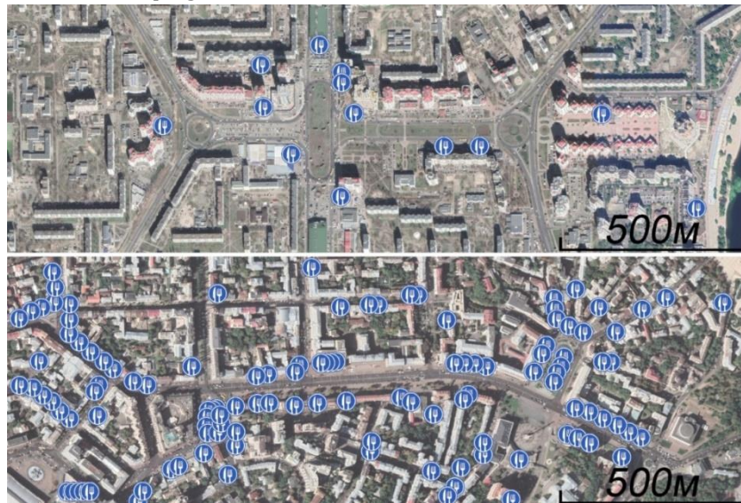
Figure 4. Number of restaurants in the public center of the residential area and in the city center on the same building area.

lack of catering establishments in the remote areas of the residential area, and in the historic center of the city there are way more of them and with a variety of cuisines (Troshkin, 2019). A large number of surveyed catering establishments mainly corresponds to the European trend that about the less time to spent on finding the catering object and on the food itself. However, the unsystematic placement of these facilities and their location in functionally adapted to the facility residential apartments on the ground floor, although corresponding to the radii of accessibility, but often negatively affects the technological processes of cooking, building aesthetics, which leads to deterioration of living quality (Figure 4).