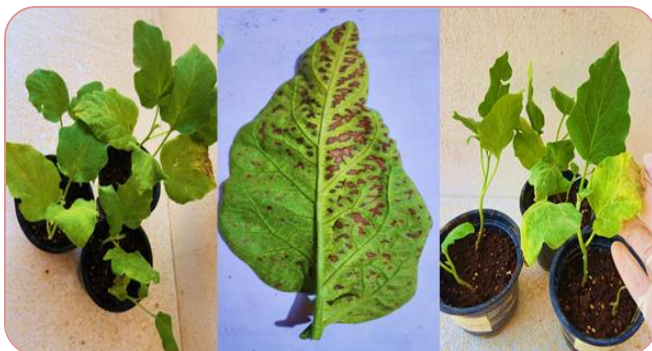
Figure 4. Symptoms of eggplant leaf spot disease caused by A. burnsii in a pathogenicity trial.

As the disease progressed, the lesions grew larger and formed dark brown to black margins, eventually becoming irregular necrotic patches on leaves, strongly mirroring the symptoms seen in naturally infected eggplant fields in Basrah (Figure 4).