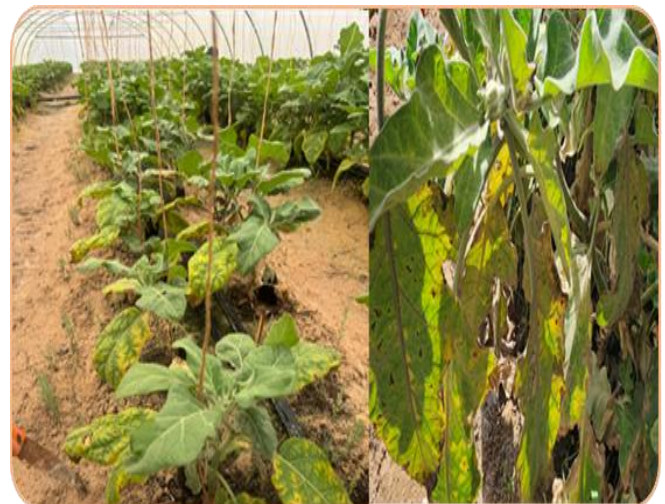
Figure 1. Field symptoms of eggplant leaf spot disease in Basrah province, Iraq.

The incidence of the leaf-spot disease in the above-ground parts of the eggplant was observed at different regions surrounding the Basrah province during the growing season of 2024 to 2025. Under cool and moist conditions, the disease followed a certain persistence and then spread on the leaves. Symptoms began as small, necrotic, circular spots on leaves with white centers and brown to dark-brown margins; which later on expanded, coalesced, and became dense, dark-brown to black areas (Figure 1).