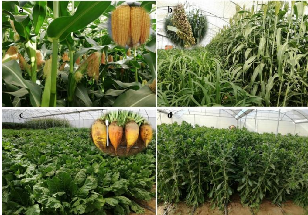
Figure 1. Canopy status conditions of the footage crops in the greenhouse conditions, a: corn, b: sorghum, c: fodder beet, and d: safflower.

were determined by following standard methods (AOAC 1990; Van Soest et al., 1991). The collected data were reported as the average of four samples. Data are presented in tables and figures as mean \pm standard deviation (SD), to indicate how spread out the data is around the mean.